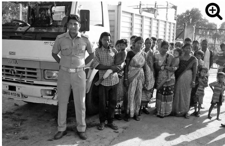
The migrant labourers who were rescued by police in Sambalpur district | Express

BALANGIR: In less than a week, police have rescued 462 migrant labourers, including women and children, most of them from Kantabanji railway station, where they had huddled to board a train in a search of greener pasture. Sources said most of the rescued labourers were from drought-prone pockets of Western Odisha and had such things in common — poverty, illiteracy and ignorance. And they were not migrating for money, but just to arrange two square meals to sustain themselves and their families. While migration and drought are synonymous to the region, for the first time, police seem to have acted and rescued them.